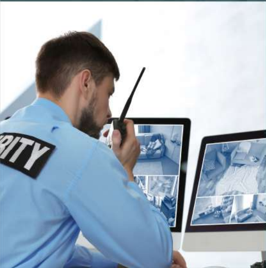
Peace of Mind Safety & Security Monitoring